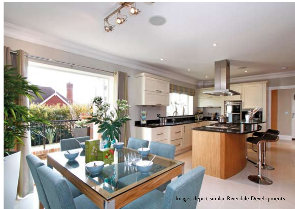
Images depict similar Riverdale Developments