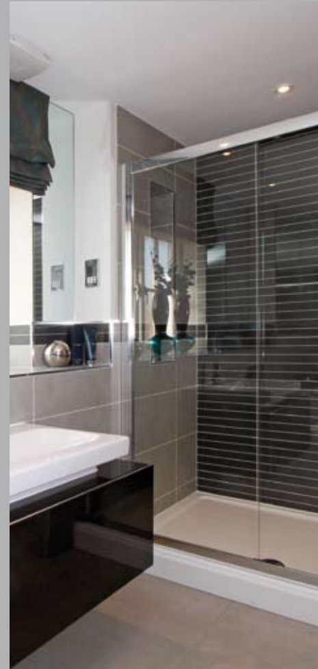
Image depict similar Riverdale Developments