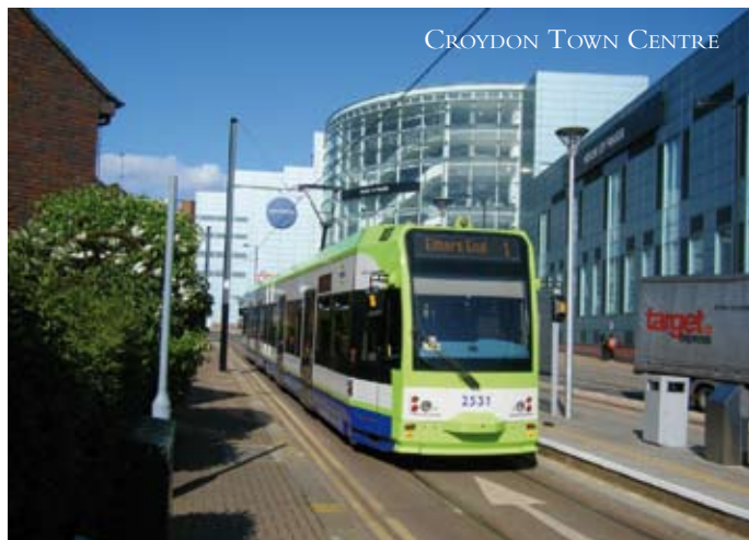
CROYDON TOWN CENTRE