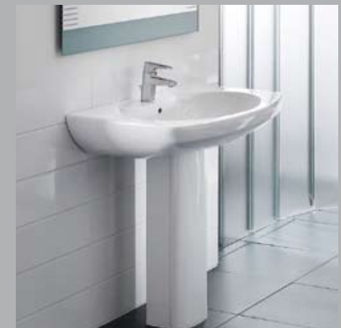
Marketing images of Roca bathrooms