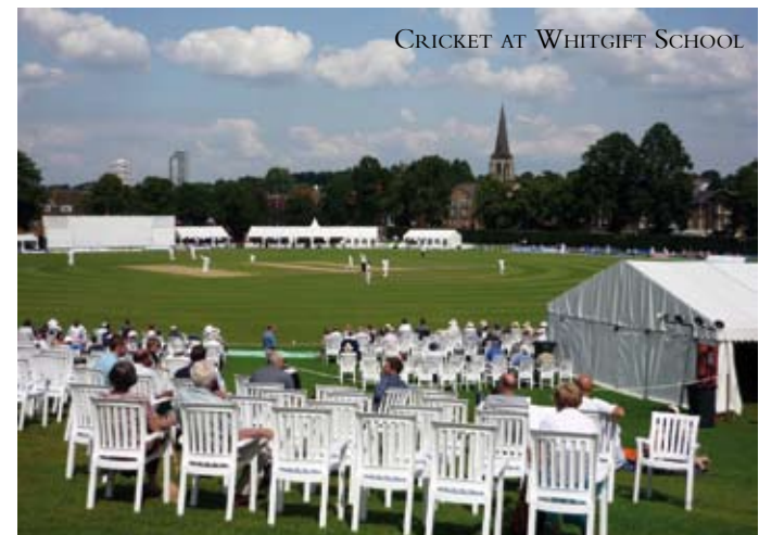
CRICKET AT WHITGIFT SCHOOL