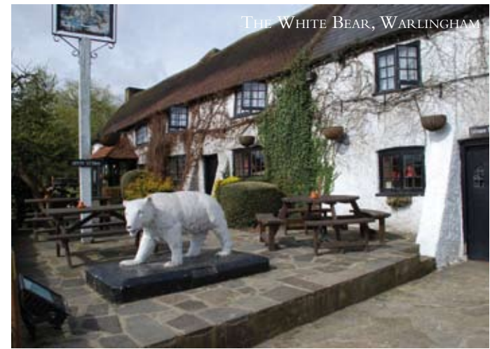
THE WHITE BEAR, WARLINGHAM